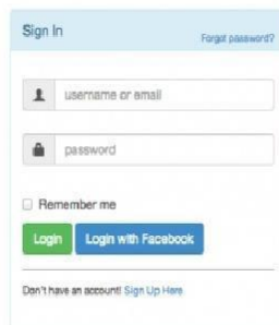
Figure 2: User Login Page