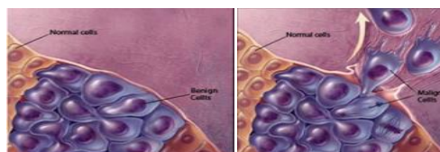
Fig. 1 Example for Benign cells and Malignant cells

The cancer having abnormality in cells lives in breast lobes or duct. Benign is a non invasive breast cancer which cannot spread out side breast but in breast lobes of ducts.