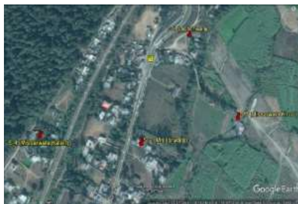
Figure 1: Map showing Sampling Sites