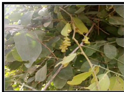
(4) Fruit part