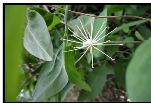
(2) Flowering part