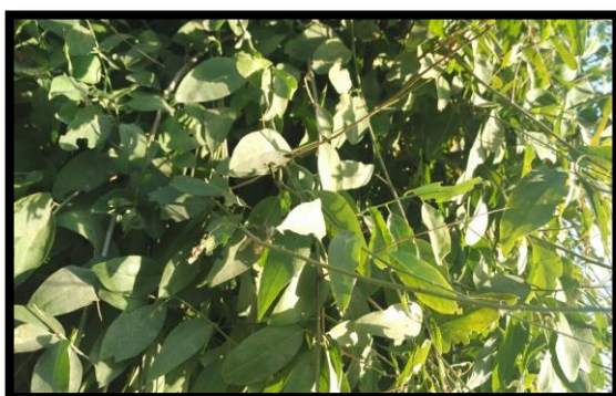
(3) Leaves part