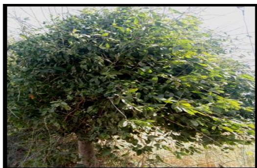
(1) Whole plant

Unani: Harasingaar. Hindi: Hemkand, Potiakand, Wagboti Tamil: Bhumichakkarai Gujrat: Hemkand, Kala-pinjola Punjab: Pilwani Rajasthan: Orapa