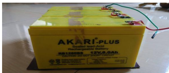
Fig 4: 12V Battery

Battery is used for storage purpose. Generated energy from generator is transferred towards the controller through battery. Micro capacity wind turbine uses battery to store energy and once it is fully charged it can be used for various domestic applications. Afterwards it can be replaced with another battery to store energy.