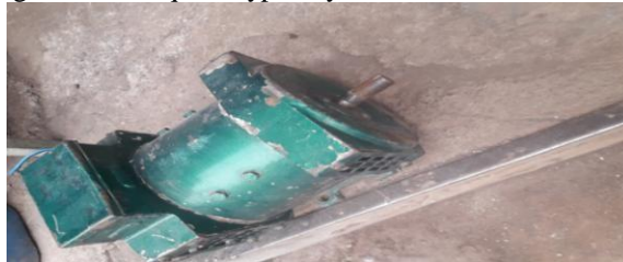
Fig 2: permanent magnet generator

When the wind speed is below rated speed, generator torque is used to control the rotor speed to capture as much power as possible. When the tip speed ratio is held constant at its optimum value the most of the power is captured. This means that as the wind speed increases, rotor speed will increase proportionally. The difference between the aerodynamic torque and generator torque is that aerodynamic torque is captured by the blades and the generator torque is applied to controls the rotor speed. The generator torque control is active when the blade pitch is typically held at a certain constant angle which captures the most power. The generator torque is typically held constant while the blade pitch is active.