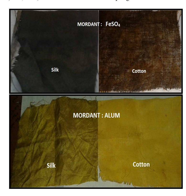
Fig 1: Cotton and silk cloth after dyeing in presence of mordant FeSO_4 and alum.

Shades of yellow color dye were obtained from marigold flowers. Mordant play very important role in imparting color to the fabric. With the use of ferrous sulphate the brown colored shade was obtained for cotton cloth while silk gave black color. Strong co-ordination tendency of Fe enhances the interaction between the fiber and the dye, resulting in high dye uptake (D.Jothi, 2008).Mordant Alum gave golden color to silk while yellow color was retained on cotton cloth.The mordanted cotton and silk cloth was immediately used for dyeing because some mordants are light sensitive. The chromatophore in the dye makes the resistant to photochemical attack, but the auxochrome from dye may alter the fastness (Jothi, 2008). Silk cloth showed excellent dyeing.