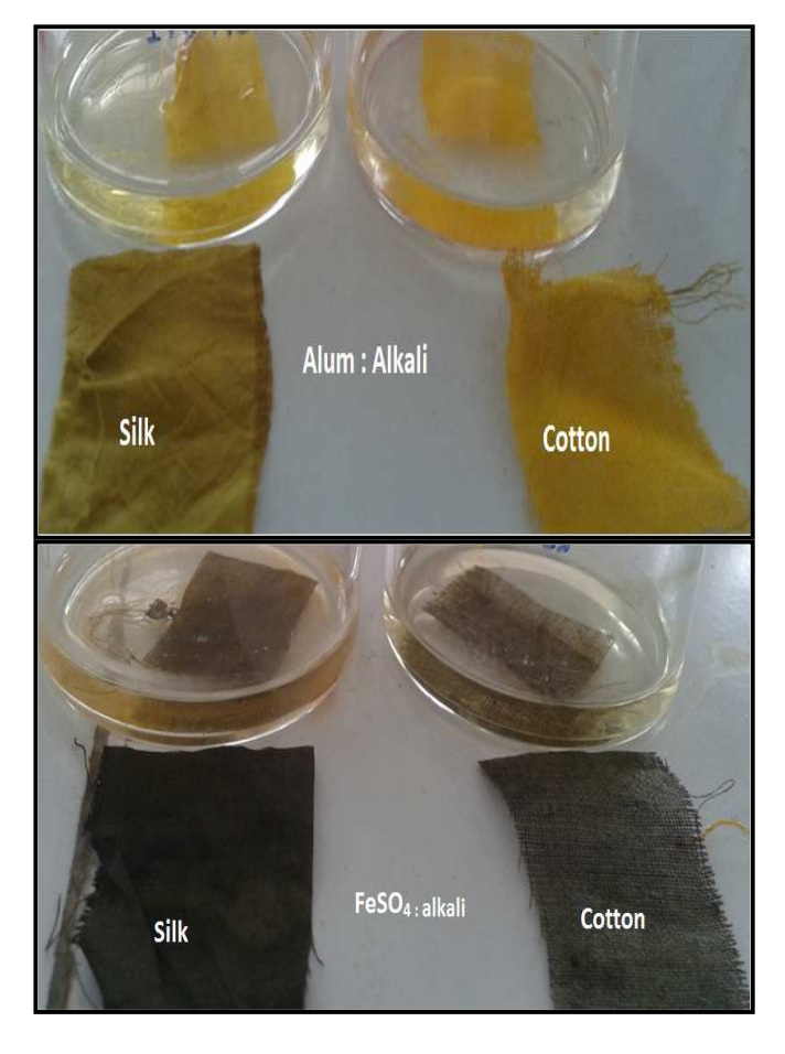
Fig 3: Cotton and Silk dye color faded in presence of alkali.

Fig 2: Cotton and silk dye color enhanced after treatment with acid