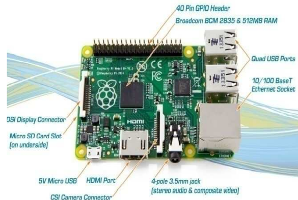
Fig.2: Raspberry Pi B+ model

Now the main thing comes that is Raspberry pi is a micro-controller kit with in-built ARM11 board provided with internet/Ethernet connectivity, dual USB connector, 512MB memory and works on Linux operating system [5]. The main use of raspberry pi is to convert conventional television to smart TV.