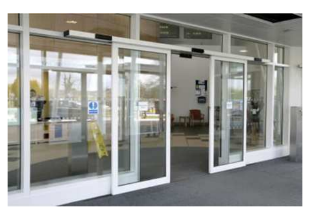
Fig. 1 : Target environment

Automatic door systems are installed at many places such as shopping malls, airports, office places, etc. Typical automatic sliding door is as shown in Fig. 1. These doors open automatically when presence of one or many people is detected. If the door is installed at public places, the door opens for everyone, and if it is installed at private places with restricted access, then some form of access control mechanism is employed.