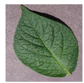
Fig 4: Potato early Fig 5: Potato healthy blight