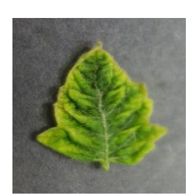
Fig 16: Tomato yellow leaf curl virus