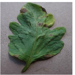
Fig 8: Tomato early Fig 9: Tomato healthy blight