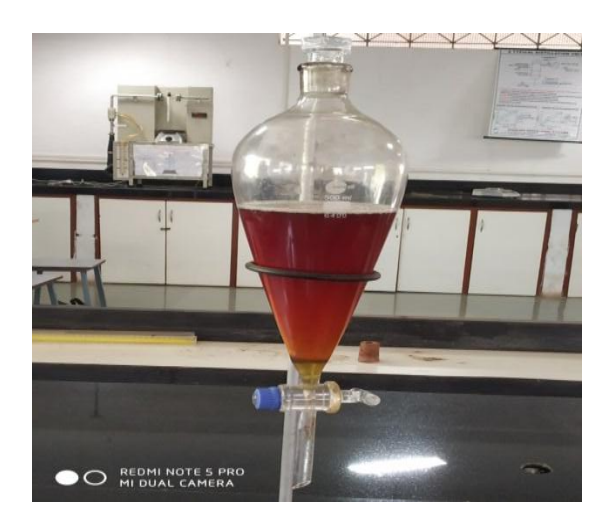
Fig 3: Solvent Extraction

Liquid –liquid extraction also known as solvent extraction is method to separate components based on their relative solubility in two different soluble liquids .usually water and organic solvent. It is an extraction of substances from one liquid into another phase. Liquid –liquid extraction is a basic technique in chemical laboratories where it is performed using a separating funnel. This type of process is commonly performed a chemical reaction as part of the work –up