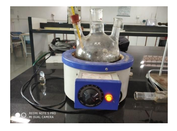
Fig 1: Dehydration Unit

Water can also affect the additive package through water washing and hydrolysis .leading to acids and additive depletion. Water encourages rust and corrosion and will cause increased wear as result of aeration changes in viscosity resulting in film strength failure, vaporous cavitations. Finally, water is a generator of other contaminates in the oil such as waxes, suspension carbon and oxides insoluble and even micro-organisms.