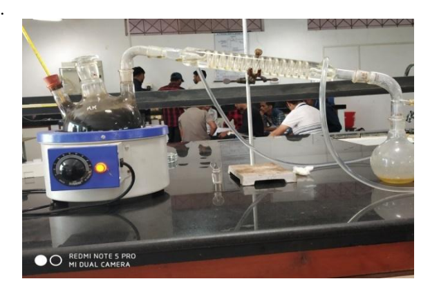
Fig 2: Vacuum Distillation Unit

3. Residue: The non-distillable part of the feedstock. This contains all the carbon, wear metals, degraded additives and most of the lead and oxidation products. This residue is successfully used as bitumen extender for roading [5].