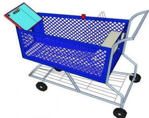
Fig 2 The proposed Smart Trolley